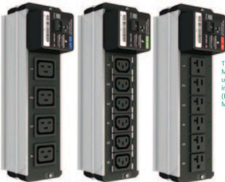
The adaptive Liebert MPX offers a variety of user specified modules, including the MPX BRM (Branch Receptacle Module).

Data centers are moving to high density blade servers to utilize more processing power in less rack space, simplify cabling and reduced power consumption. Liebert MPX allows the data center to respond quickly to change, making it the right choice to manage the infrastructure.